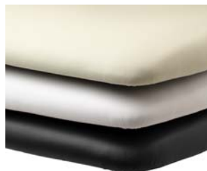
Seat cushions available in Ivory, White, or Black