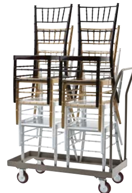
All Purpose Dolly