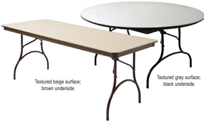
Textured beige surface; brown underside